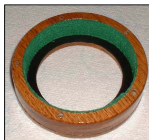
Final fit before adding the solar film