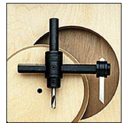
Circle Cutter leaves a lip