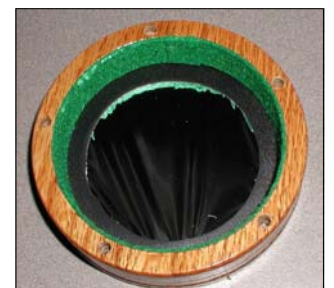
The finished solar cell (back).