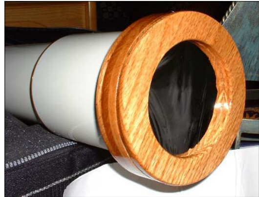
The finished Solar Filter Cell (front)

Using a small amount of glue, glue the solar film loosely (don't pull tight) to the plastic ring and let the glue dry. Place the front ring against the solar film with the black plastic face up. Position the three rings on the plastic, align the screw holes and screw the pieces together. Using screws allows us to replace the solar film later, if needed.