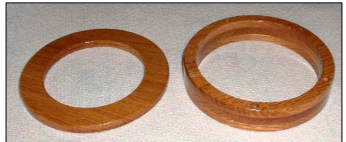
The cell after drilling and coating